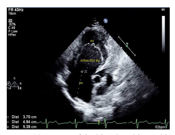
Figure 4: Measurement of the right atrium, right ventricle and the atrialized right ventricle

which turned out to be normal. The X-ray showed the presence of cardiomegaly with the presence of dilatation of right sided chambers. (Figure 5)