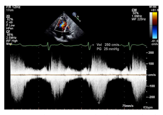
Figure 2: Continuous wave Doppler signal across the tricuspid value showing low pressure tricuspid regurgitation of severe intensity

electrocardiogram (Figure 1) revealed a pattern suggestive of an old inferior wall myocardial infarction which was initially suspected in her but surprisingly the echo cardiogram revealed that the patient had a severe form of Ebstein's anomaly with the left ventricle entirely compressed by the right and the presence of an atrial septal defect which was shunting left to right. (Figure 2–4, Video 1–3)