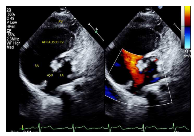
Figure 3: Colour Doppler still across the atrial septal defect showing a left to right shunt

The patient had no prior history of chest pain or any symptoms of exertional dyspnoea and was able to perform all her routine activities and her daily chores with the presence of mild fatigue and dyspnoea on unaccustomed activity which she considered normal for her age. There was no prior history of chest pain or exertional angina. The echocardiogram also did not reveal any regional wall motion abnormality in the inferior wall territory which would suggest the presence of an infarct and the cardiac enzymes were also normal. The patient was taken up for a diagnostic coronary angiogram