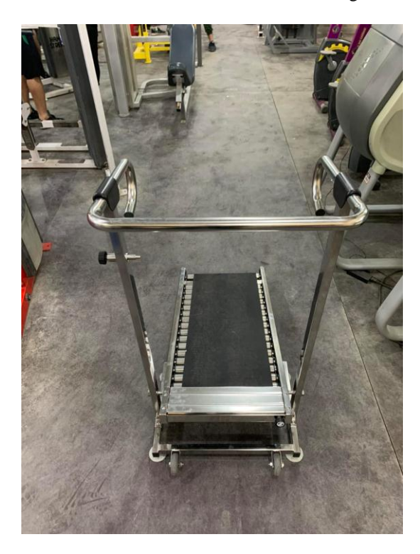
Annex #2 Images of the devices and tools used

ISSN: 0975-3583, 0976-2833 VOL 12, ISSUE 02, 2021