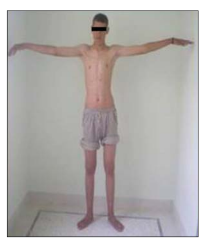
Figure 1: Long-legged (height of 1.84 m) patient with raised elongation rate (1.06 m)

angiographies of the supra-aortic trunk were normal. The thoracic CT-scan angiography did not show dilatation of the aorta, while the abdominal CT-scan angiography demonstrated infarction of spleen and both the kidneys. Diagnosis of Marfan syndrome with infectious endocarditis complicated by ischemic stroke was retained. However, the family pathological history was negative. The diagnosis of Marfan syndrome was confirmed considering the following findings: Ligamentous hyperlaxity, crystalline ectopia and mitral valve prolapsus with mitral insufficiency. The patient benefited from antibiotherapy for 4 weeks. He also underwent sessions of motor physical therapy and orthophonic rehabilitation. Then, the cardiac surgery was carried out and valvuloplasty was performed [Figure 4]. The surgical treatment confirmed the presence of mitral insufficiency and prolapsus of the big mitral valve and multiple friable anterior-posterior vegetations with broken cordage of the small mitral valve [Figure 4]. The post-surgery follow-ups were simple. The evolution