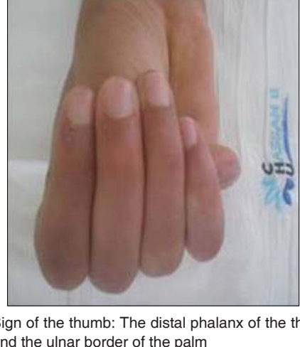
Figure 2: Sign of the thumb: The distal phalanx of the thumb can be joined beyond the ulnar border of the palm