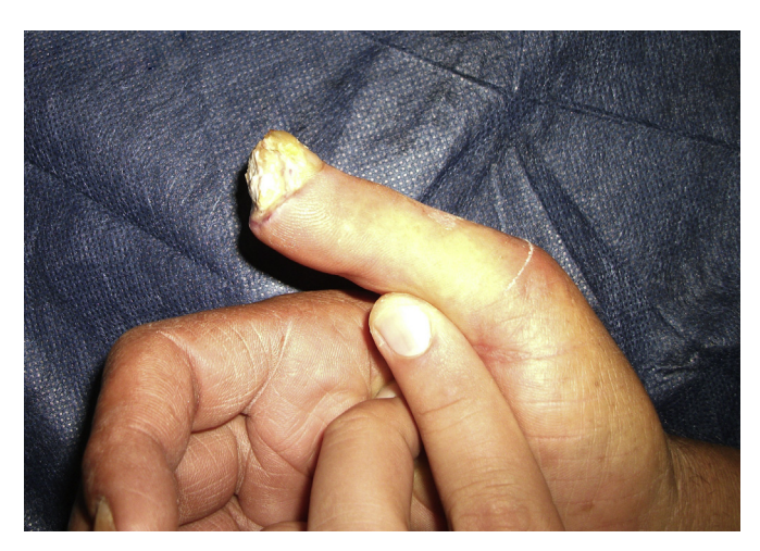
Fig. 2. Preoperatif photo of finger.

Buerger disease was firstly defined 130 years ago and the details were defined by Leo Buerger by means of hystopathologically examining the amputation specimens. Amputation risk of the long-term results of Buerger disease are 25% per 5 years, 38% per 10 years and 46% per 20 years. Tissue loss is tried to be prevented by applying medical treatment. Endovascular recovery is not a commonly applied method and by-pass operations are made only if they are beneficial without touching the diseased artery. In order to diminish the ischemic pain and prevent the possible extremity amputations lumbar and thoracic sympathectomy are used. Our patient had been femoral by-pass, lumber-thoracic sympathectomy and lower extremity amputations for 30 years.