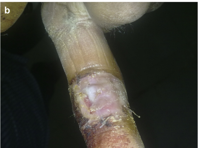
Fig. 3. a). Preoperatif angiography. b): Postoperatif angiography.

We thought and made endarterectomy as the best method for reperfusion and added cross finger flap operation. During the maintenance of the treatment, we gave cilostazol 100 mg twice per day in order to prevent thrombus formation, vasospasm and