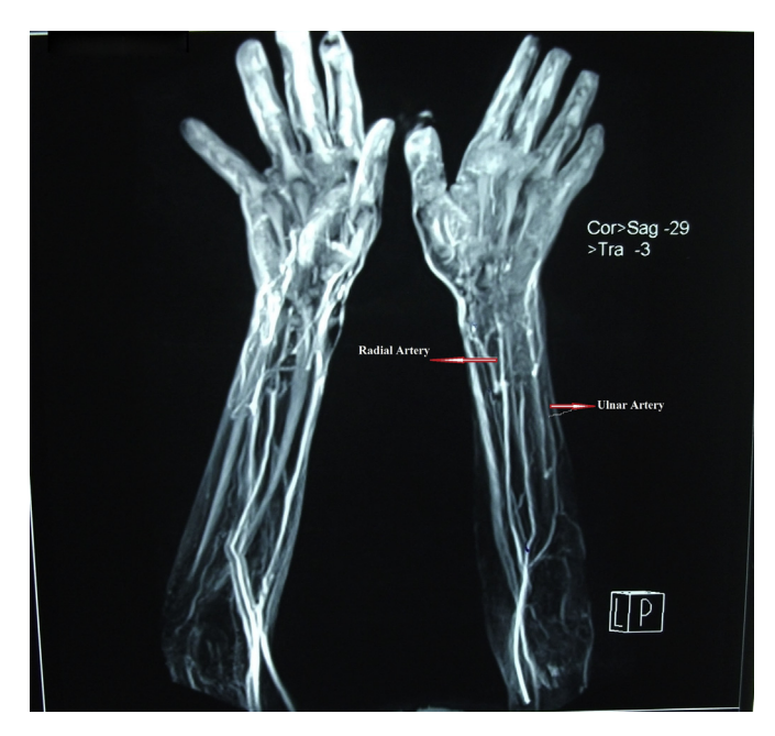
Fig. 5. Preoperatif angiography.

inflammation. After the operation, it was observed that the scar was healed, circulation was okay in terms of physical examination and angiography, and the patient had no complaints of ischemic pain.