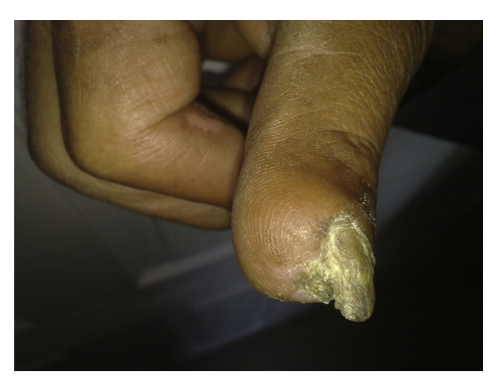
Fig. 4. Postoperatif photo of finger.

We thought and made endarterectomy as the best method for reperfusion and added cross finger flap operation. During the maintenance of the treatment, we gave cilostazol 100 mg twice per day in order to prevent thrombus formation, vasospasm and