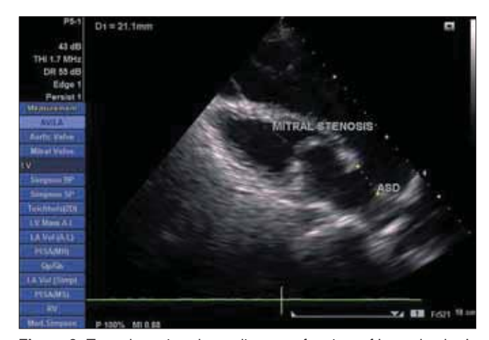
Figure 2: Transthoracic echocardiogram of patient of Lutembacher's syndrome showing thickened mitral leaflets with doming of anterior mitral leaflet with mitral stenosis and atrial septal defect