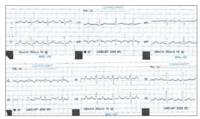
Figure 1: Electrocardiogram of patient of Lutembacher's syndrome suggestive of incomplete right bundle branch block with left atrial enlargement

With the above history and findings, a medicine consult was sought by the department of obstetrics and gynaecology, and she was allowed to continue the labour after giving her injectable furosemide to relieve her of pulmonary congestion. The diuretics were then continued and she was also started on the standard prophylaxis for Rheumatic Fever with Benzathine Penicillin 12 lakh units deep intramuscular (After Skin Test Dose) once every 3 weeks. She delivered a live female baby of 2.120 kg. She was advised surgical intervention at a later date, after Trans-Oesophageal Echocardiography. She was also advised tubal ligation to avoid further cardiac compromise which she agreed to, and she was posted for the same procedure later. She was discharged in a haemodynamically stable condition. Later on she came