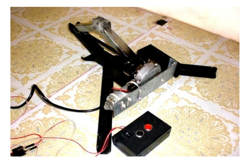
Figure 1: Developed prototype

Newly developed Jackcar prototype is shown in Figure 1. It also included a switch buttons system to raise and lowering the jack (Head load). According to Farhad, the pneumatic and hydraulic jack is not safe because usually need maintenance and sometime leaked (Rankine, 2007). The development will be based on scissor jack. Besides that, the screw shaft which can be rotated and raise the head load up and down is used. The screw shaft is a critical part because in this design it needs a system which can withstand the load and lock the raised level of the jack. The manufacturer and calculated value for the motor torque, it supplied 5.877N.m torque which is high enough and suitable for the project (Heizer and Render, 2006). The usage of the gearing system as shown in Figure 2 is to increase the torque up to17.631N.m (Shigley, 2004). Lastly, the stabilizer base is to support the weight of the motor and to stabilize the scissor jack. It is also good for flat surface when jacking the car (Kalpakjian and Schmid, 2001).