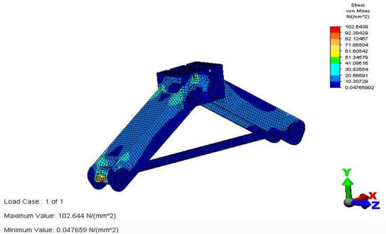
Figure 3: Maximum value for load 2943.0 N= 300kg for nodal displacement and stress Von Misses

the height of the lifting is shown in Figure5. The height is measured on Kancil 660 cc car (PDL 146). The actual car height from the ground to the base of the car is 0.13 m. The torque needed is obtained from the torque wrench where inserted into the shaft of the scissor jack. The torque is increased parallel to the height until at point 0.23m to 0.29 m the torque maintain constantly at 9 Nm. According to Razzaghi and Douglasville (2007), the maximum a car can be lifted under a safety condition is 0.32. Tables 2 show the specification for the newly developed Jackcar.