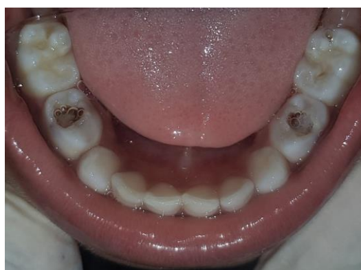
Fig 2: Deep carious lesions on right and left lower back region, involving tooth no. 74 and 84