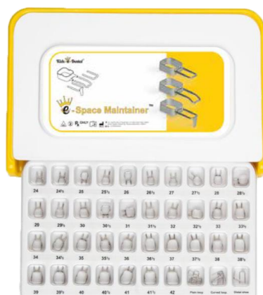
Fig 5: A prefabricated band and loop space maintainer by Kids-e-dental®