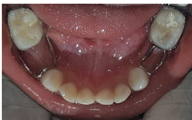
Fig 6: Conventional space maintainer on right side and prefabricated space maintainer on left side