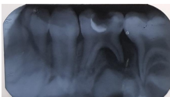
Fig 3: Tooth No. 84