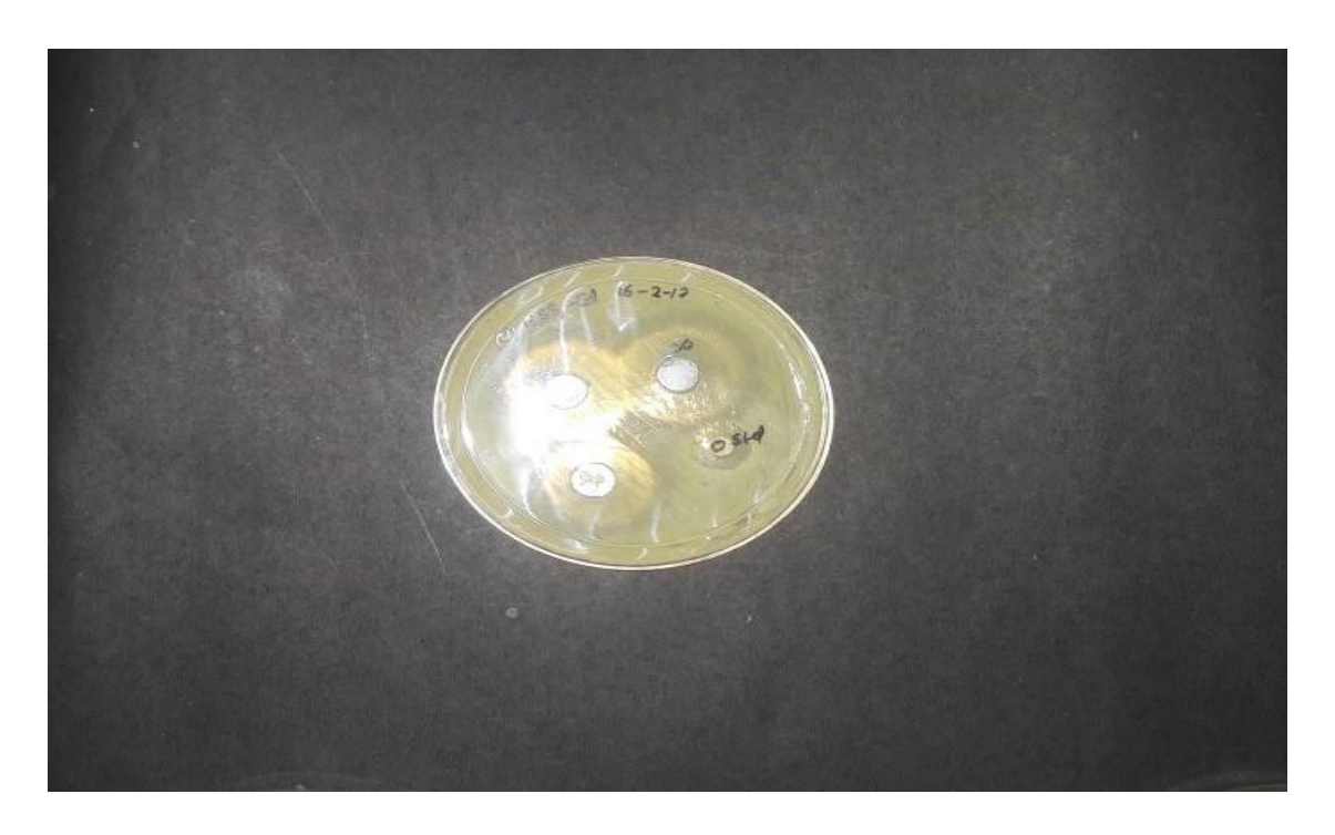
Figure 3 Antibacterial Activity of Cd (II)-SB1 against Staphylococi coagulase Gram+ Bacteria