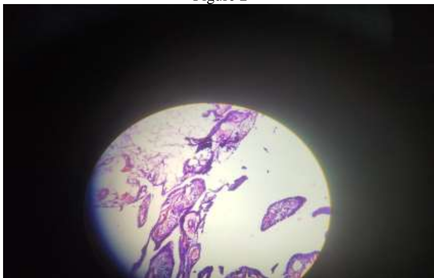
(Hematoxylin and eosin, high power view) villous proliferation of the synovium, with focal and diffuse infiltration by mature adipocytes.