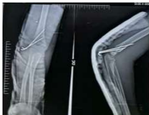
Fig 4: Elbow images