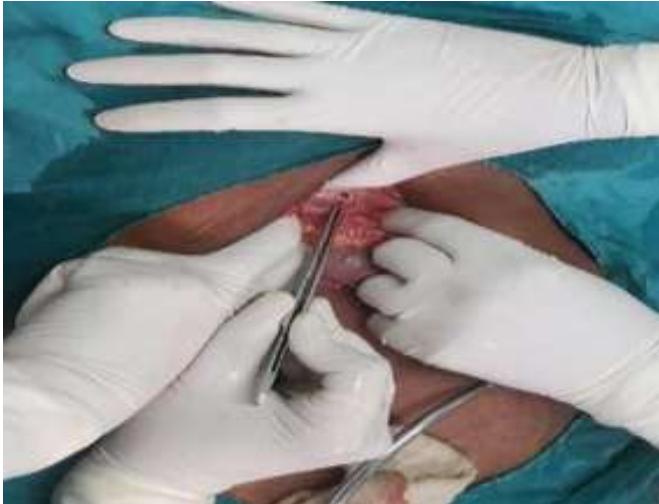
FIGURE 1: 1 cm PERFORATED PEPTIC ULCER