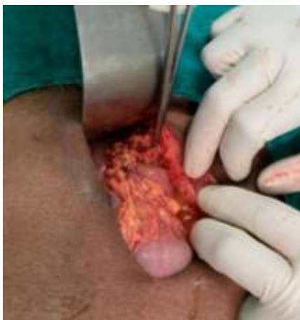
FIG.3: OMENTAL PATCH REPAIR

All Patients In Group B Underwent This Procedure. It Is Famously Known As The Thal Patch. After Suctioning Out Of Intraabdominal Collections, Perforation Site Was Identified Via Gentle Dissection Of Adhesion, And Then Necrotic Tissue And Debris Were Debrided. Then, The Second Part Of Duodenum Is Mobilized. A Loop Of Jejunum About 40–60 Cm From The Ligament Of Treitz Was Selected And Brought Above The Transverse Colon And Sutured To Defect In Serosa-To Serosa Fashion With A Vicryl Or Silk Suture Preferably 2-0 In Size Taking Bites Atleast 2–3 Cm Away From Defect Site. At A Distance Of 20 Cm From The Patch Jejuno-Jejunostomy Was Performed. Intraperitoneal Wide-Pore Drain Was Inserted In The Pelvis And Right Subhepatic Space (Fig. 4)