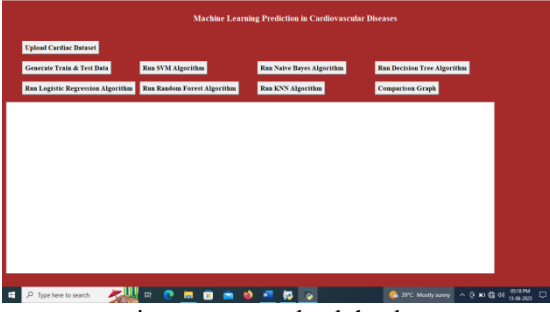
previous screen, upload the dataset.

Using the 'Upload Cardiac Dataset' button on the