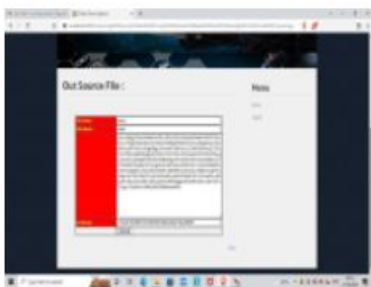
Fig 4.2 Encrypted Data