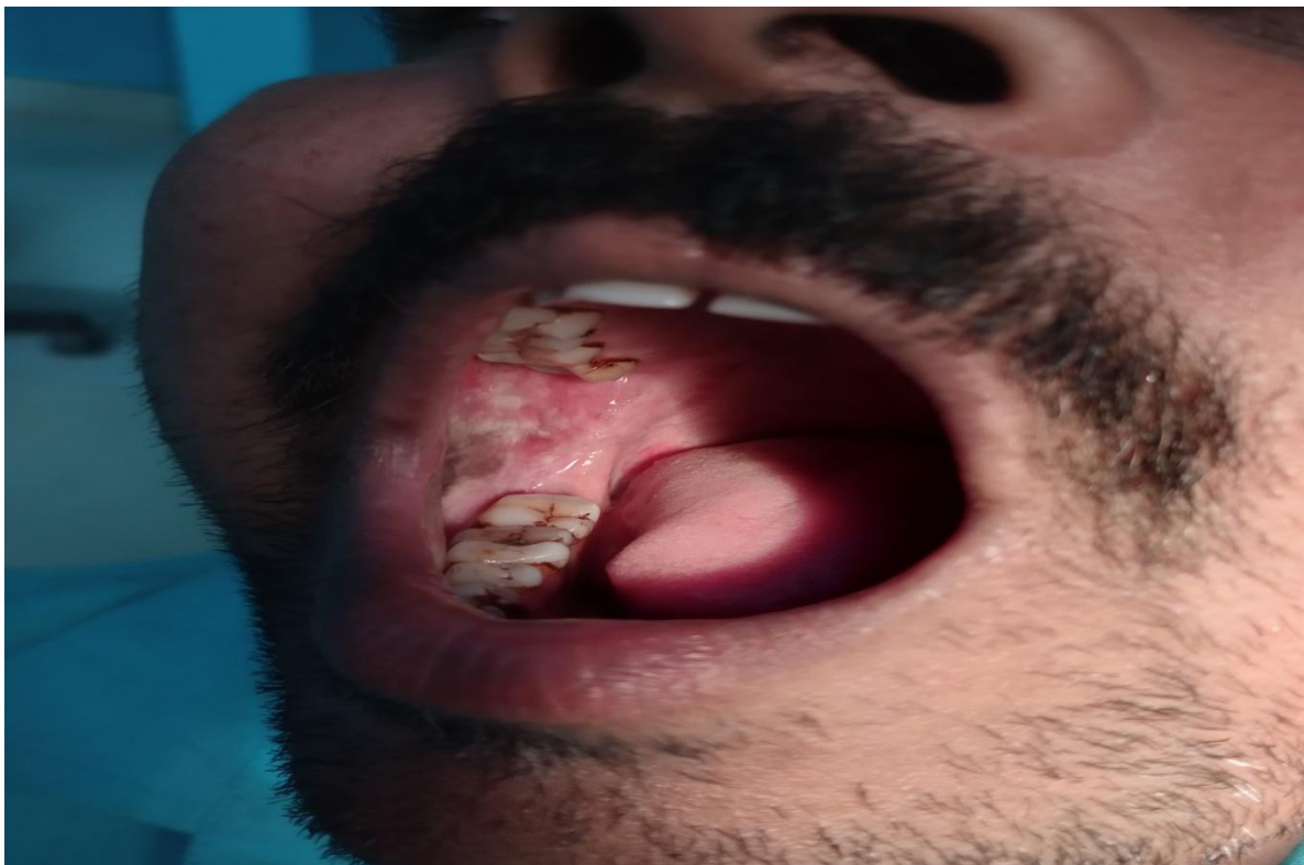
Figure 1: Showing speckled leukoplakia in right side of buccal mucosa.

years with a frequency of 2 to 3 times per day. Along with these the patient also consumed alcohol occasionally. Intraoral Examination of right buccal mucosa revealed firm, non tender, non scrapable, red and white patches measuring 2 x 2 cm. Surface appears rough and slightly elevated which clinically resembled speckled Erythroplakia in appearance. The lesion was intermixed with red patchy areas. Chair side investigation, toluidine blue staining was carried out to select the area of biopsy to be made. The selected area was then biopsied (incision). Histopathologic examination with H and E stained sections showed squamous epithelium overlying connective tissue stroma. The epithelium shows Dysplastic features such as broad rete ridges, acanthosis, hyperchromatism, basilar hyperplasia, cellular and nuclear pleomorphism, and abnormal mitosis, Individual cell keratinization and intraepithelial keratin pearls formation. The dysplastic epithelial changes has extended top to bottom. Connective tissue stroma is highly cellular with dense infiltration of chronic inflammatory cells, dilated and proliferated capillaries. The overall clinical and histopathological findings were considered diagnostic for speckled leukoplakia transforming into carcinoma in situ.