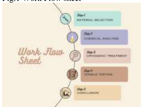
Fig.1 Work Flow sheet

First the materials which are needed to be treated are selected according to the experiment. Then these materials are undergone for chemical composition. Later the materials are tested by Traditional heat treatment and Deep cryogenic treatment. After completion of both the tests these materials are put to Mechanical testing i.e., tensile test, where these test results are compared. Later keeping these results to consideration we draw conclusions and the benefits of cryogenic treatment.