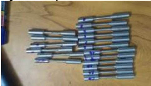
Fig.4 Test sample

The tensile test on metals or metallic materials is mainly based on the standards DIN EN ISO 6892-1 and ASTM E8. The ASTM E8 / ASTM E8M standard describes uniaxial tensile testing of metals at room temperature and the determination of characteristic values including yield strength, yield point, yield point elongation, tensile strength, strain at break and reduction of area. EN8 engineering steel is an unalloyed carbon steel with reasonable tensile strength. It can be flame or induction hardened and is a readily machinable material 3 . When heat treated, EN8 offers moderate wear resistance.