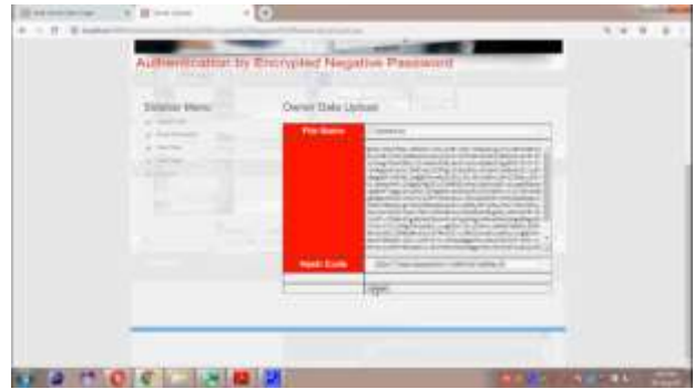
Fig 4:Data Upload Page