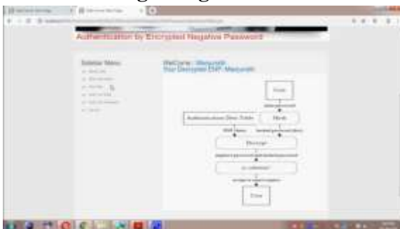
Fig 3:Home Page