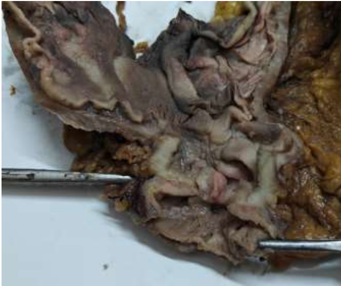
Figure 1: Gross picture of carcinoma stomach showing infiltrative growth and localised thickening of the wall involving the pyloric antrum.