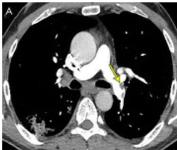
Figure 2. CT pulmonary angiography showing evidence of pulmonary thromboembolism with peripheral thrombus located within left pulmonary artery.