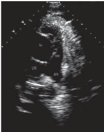
Figure 1: Trans-thoracic echo showing connection between aorta and pulmonary artery (Ao: Aorta; MPA: Main pulmonary artery; LPA: Left pulmonary artery; Arrow - ruptured right sinus)