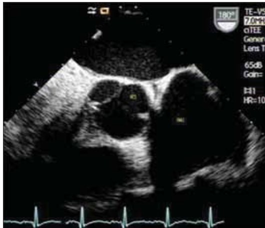
Figure 2: Trans-esophageal echo showing RCS aneurysm (RCS: Right coronary sinus; ANU: Aneurysm of sinus)